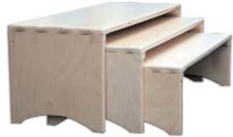
Pictured as a three bench set. Now available in four sizes.