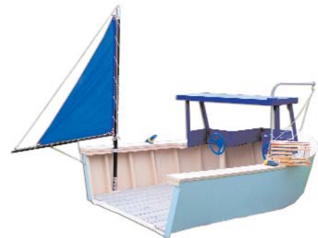
Accessible Lobster Boat Playground Equipment