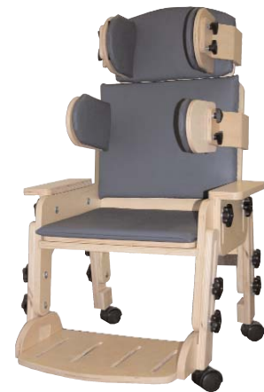
Custom Therapeutic Chair