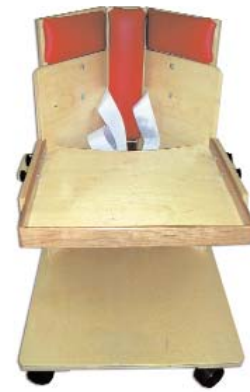
Custom Corner Chair

The Kids' Project will continue to communicate with you throughout the design and construction process to ensure your satisfaction with the finished product.