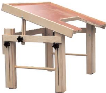
Shown with table top in angled position