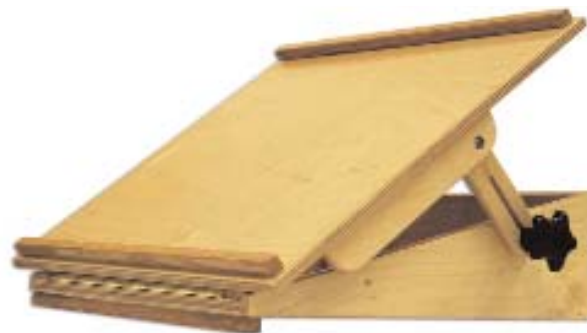
TKP33 Adjustable Incline Board $70.00 Dimensions: 16" x 18" x 5 1/2"

With a turn of the knob, the work surface adjusts from a 15-degree to 35-degree angle. Designed for use on a desktop, table or wheelchair tray. The front edge is designed to overlap a working surface. Constructed of Baltic birch plywood.