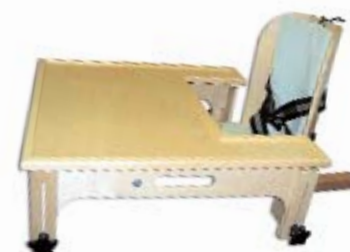
Adjustable Corner Sitter pictured with Adjustable Tray. Learn more on page 9.