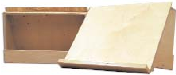
TKP17 Desktop Easel $60.00 Dimensions: 20" x 12" x 9"

Great for writing, drawing, painting and even reading, this therapy tool helps promote independence in handwriting, wrist extension, fine motor skills and hand development. It also promotes visual attending as well as proper positioning of the upper extremity. This item is constructed of quality Baltic birch plywood. The Desktop Easel includes a handy storage space.