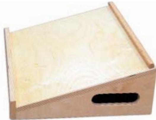
TKP03 Small Incline Board $40.00 Dimensions: 12" x 16" x 5 1/2"

Incline Boards are designed for use on desktops, tables or wheelchair trays. The boards are made of high-quality, durable Baltic birch plywood and feature a 15-degree angle. The front edge is designed to overlap a working surface, thereby reducing slippage. The large incline board is designed to fit a standard size desk and is suitable for any child who would benefit from a larger work area.